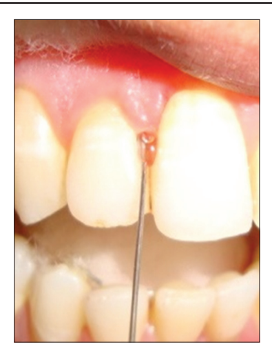
Figure 5: Subgingival application of polyglycolic acid-based 0.5% azithromycin gel into the pocket