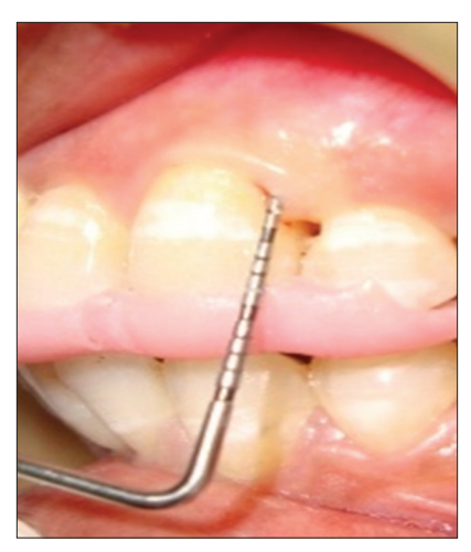
Figure 11: Post-operative measurements at 6 months: Fixed reference point to base of pocket

desired clinical outcomes, and the patient's dental and medical history.<sup>[14]</sup>