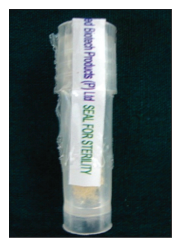
Figure 2: Sterile container of tetracycline hydrochloride fibers (2 mg)