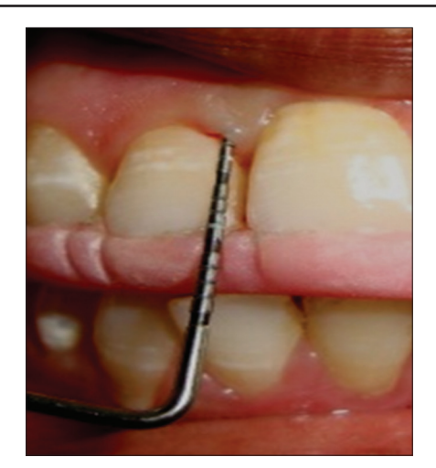
Figure 8: Experimental site A Post-operative measurements at 3 months Fixed reference point to base of pocket

limited side effects, and it does not need to be administered daily for a defined time period. On the other hand, systemic administration of antibiotics facilitates treatment of bacterial reservoirs of reinfection such as the tonsil, saliva, and tissue invasive bacteria. It also is more