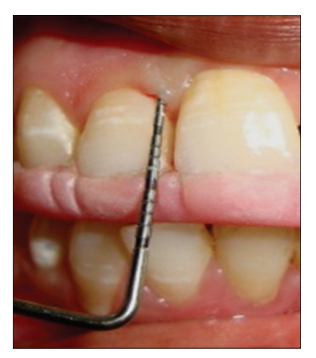
Figure 9: Post-operative measurements at 6 months Fixed reference point to base of pocket