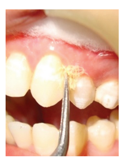
Figure 7: Subgingival application of tetracycline fiber 2 mg into the pocket

limited side effects, and it does not need to be administered daily for a defined time period. On the other hand, systemic administration of antibiotics facilitates treatment of bacterial reservoirs of reinfection such as the tonsil, saliva, and tissue invasive bacteria. It also is more