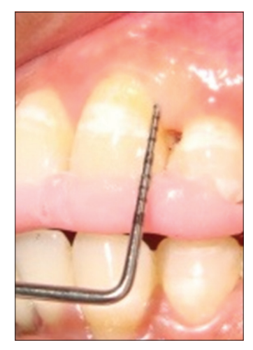
Figure 6: Experimental site B Baseline measurements ("0" day) Fixed reference point to base of pocket